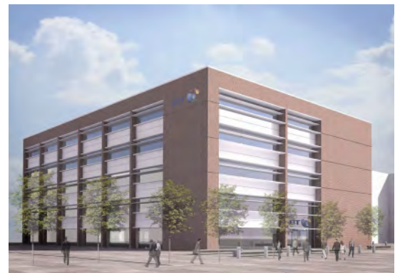
Artists impression of the All Saints building

It is estimated that over 5,390 jobs will be created at West Bromwich town centre. Overleaf analysis of the potential job creation and the associated skills needs required at the development is provided.